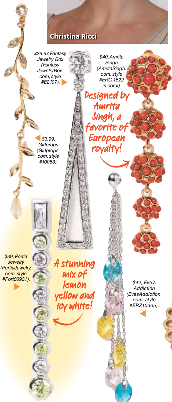
$29.97 Fantasy Jewelry Box (FantasyJewelryBox.com, style #E2107).