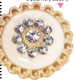
$10, Laila Rowe (LailaRowe.com, style #64591).