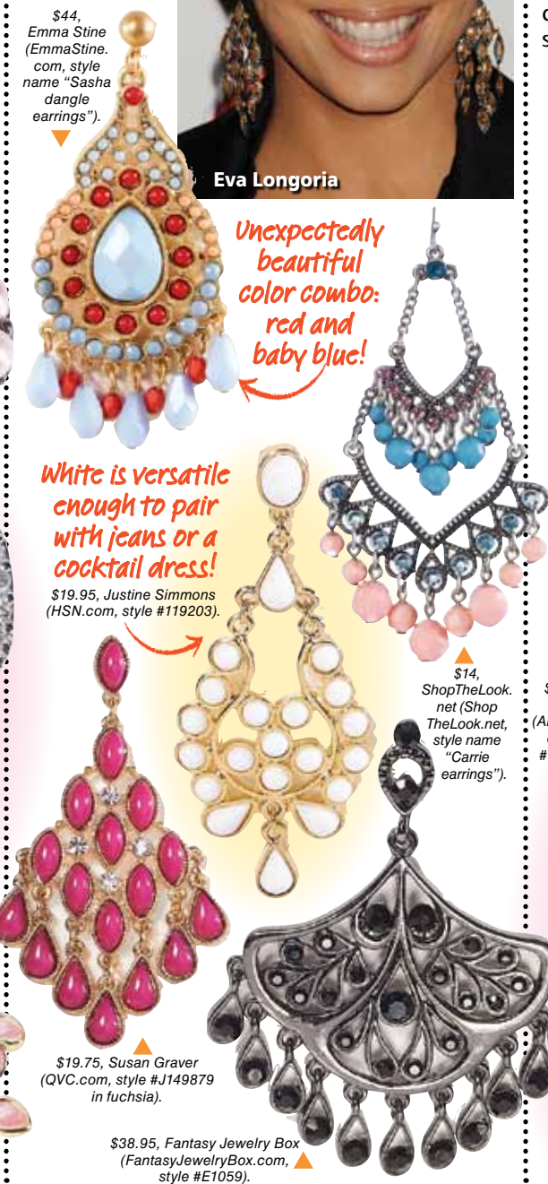
$44, Emma Stine (EmmaStine.com, style name "Sasha dangle earrings").

Unexpectedly beautiful color combo: red and baby blue!