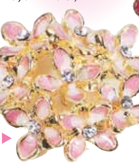
$56, Eve's Addiction (EvesAddiction.com, style #ERZ10457).

Everyone will think they're cushion-cut tanzanites!