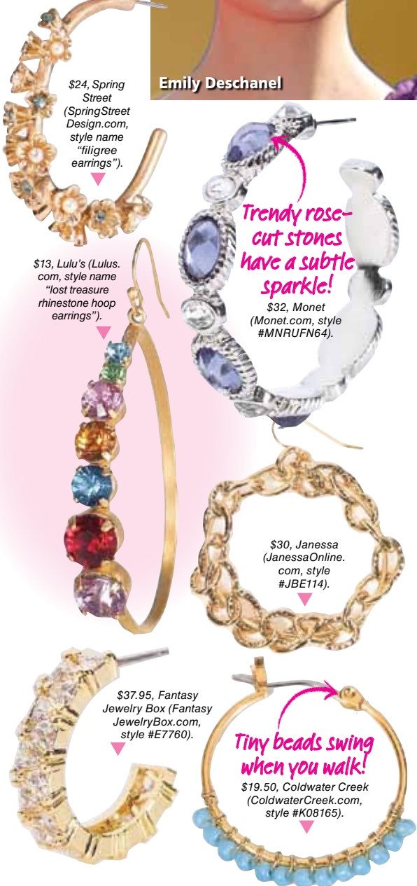
$24, Spring Street Design.com, style name "filigree earrings").

NEXT WEEK: Get a designer look for less!